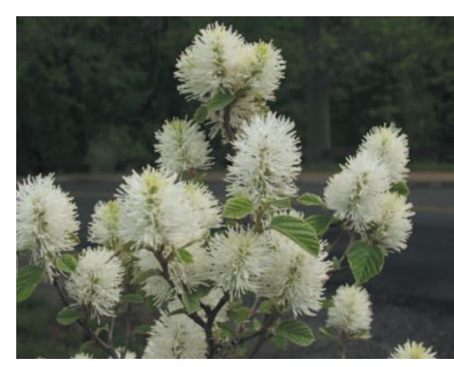
Dwarf fothergila flower