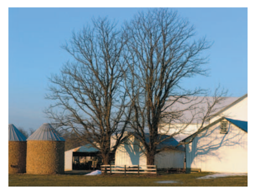
Kentucky coffee tree