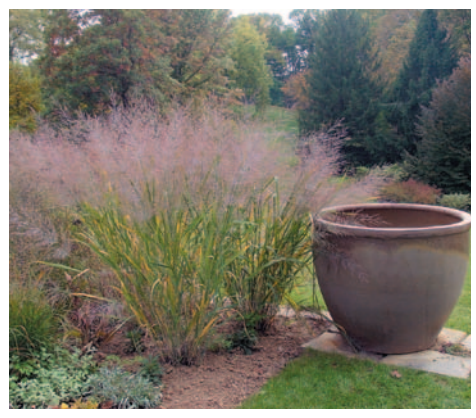
Dallas blues switchgrass