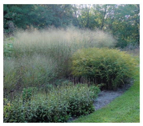
Cloud nine switchgrass