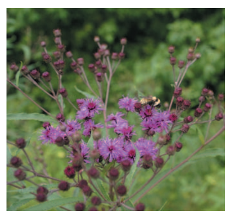
New York ironweed