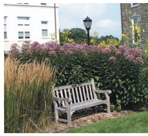
Joe pye weed