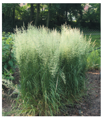
Feather reed grass