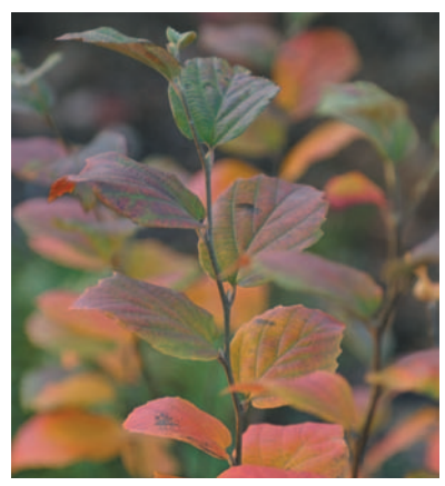
Dwarf fothergilla leaves