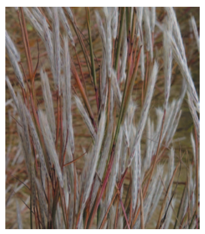
Silver bluestem flower