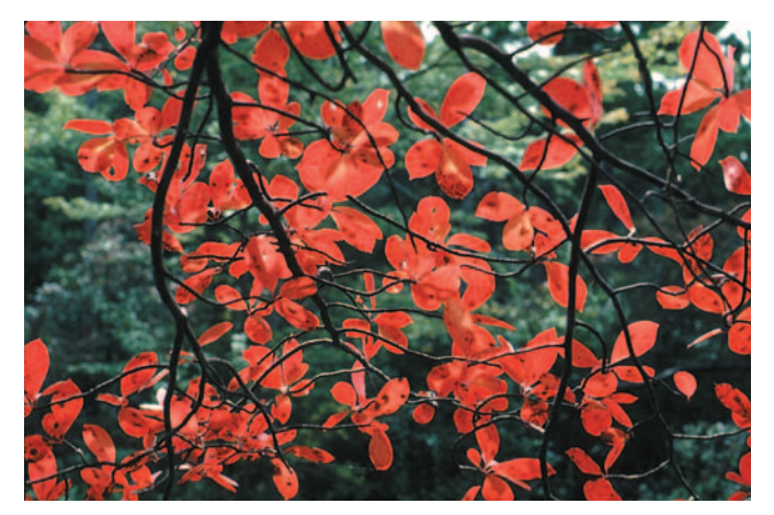
Black gum leaves