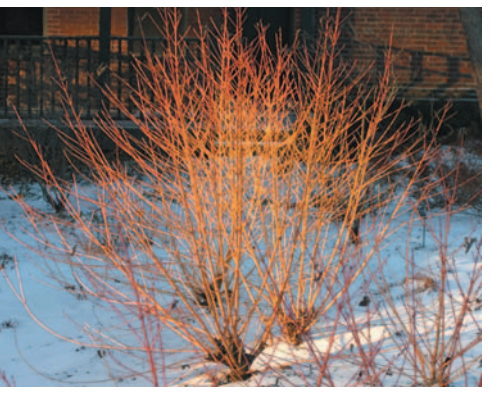
Red twig dogwood