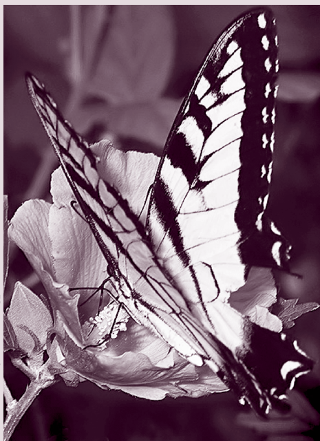
Tiger Swallowtail butterfly on Purple Hollyhock, (above), and a honey bee on a large holly bush in the Atlanta, Georgia area.

A diverse group of butterflies are present in garden areas and woodland edges that provide bright flowers, water sources, and specific host plants. Numerous trees, shrubs, and herbaceous plants support butterfly populations.